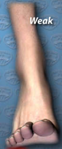
What Part of Your Forefoot Do You Launch From? From the Inside Under Your Big Toe (Left) or From the Outside (Right)