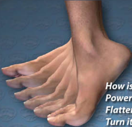
How is Your Foot Power Stroke? Flattened Arches Can Turn it Into Mush!

For more information and a professional consultation regarding whether Sole Supports may be helpful for you, please contact the following certified Sole Supports practitioner: